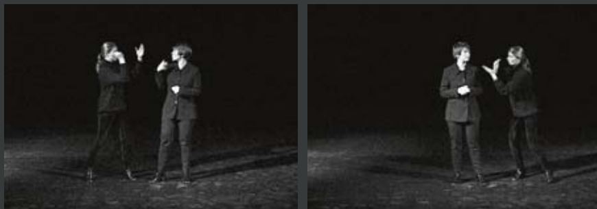
– Stills from documentation of performance of Gehörlose Musik (1998) by Die Tödliche Doris.