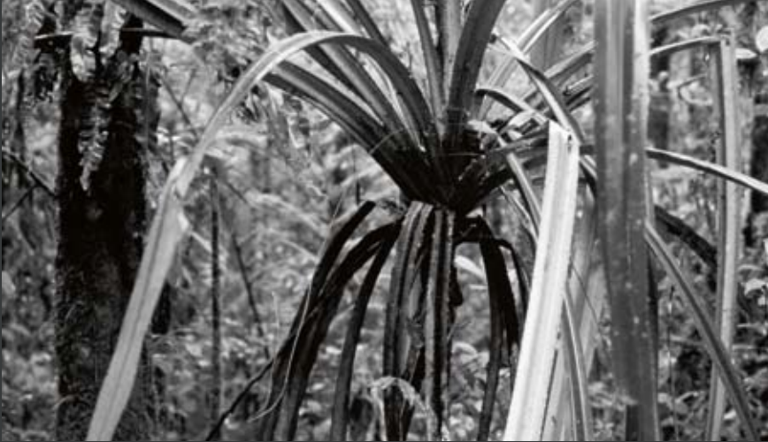
– Still from Crystal Palace (2007) by Mathias Poledna. © Mathias Poledna.