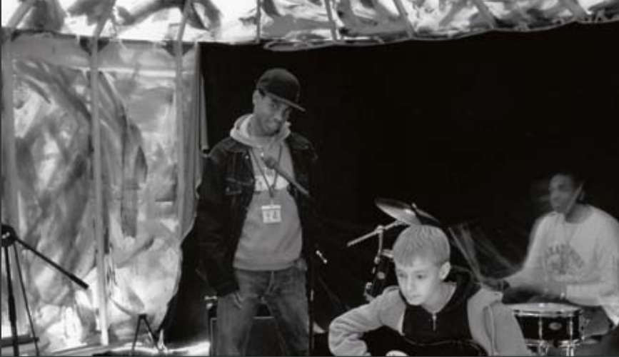
– Installation view of The Club in Shadow—Reverse Karaoke (2005–present) by Kim Gordon and Jutta Koether, from the exhibition Her Noise at South London Gallery 2005.