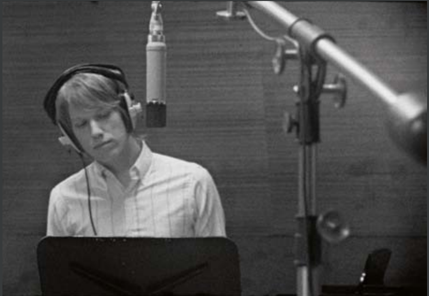
– Still from Western Recording (2003) by Mathias Poledna. © Mathias Poledna.