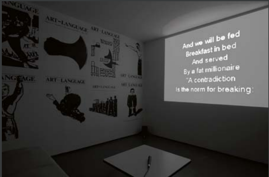
- Installation view of Karaoke Bar (2005) by Art & Language with The Red Krayola.